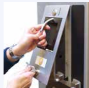
Removable loading drawer