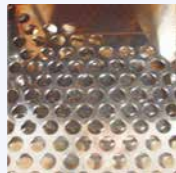
Special loading drawer